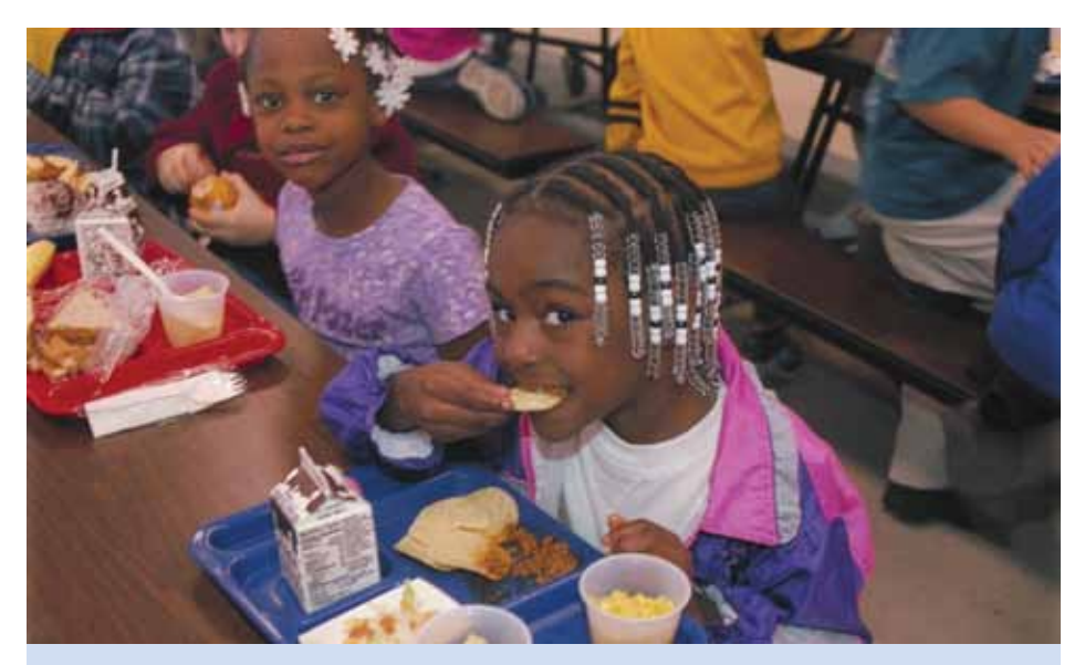
he Affordable Care Act addresses recommendations from the public health community and represents a bold step for the nation in creating a system that promotes wellness.

At this time, there is ambiguity in the law about the extent to which funds are authorized and/or appropriated, creating uncertainty about the precise amounts of funding that will actually be available. The law often uses language such as "there are authorized to be appropriated such sums as may be necessary to carry out this section" (Section 4004), and "out of any funds in the Treasury not otherwise appropriated, there are appropriated $1,000,000 for fiscal year 2010 to carry out this subsection" (Section 4203). Many sections do not include any language about funding, creating uncertainty about future funding. The Congressional Budget Office has published a table of authorizations subject to appropriation in order to clarify which provisions have specific dollar amounts authorized (by year) and which provisions do not yet have a specified budget.8 The success of the Affordable Care Act's prevention and public health initiatives will depend not only on whether